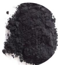
2 | Pre-Carbon