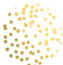
1 | Sediment