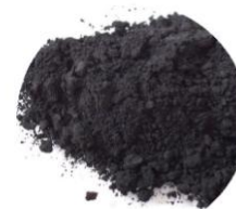
4 | Post-Carbon