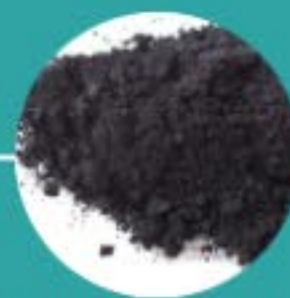
4 | Post-Carbon