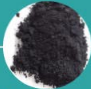
2 | Pre-Carbon