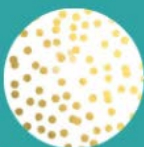
1 | Sediment